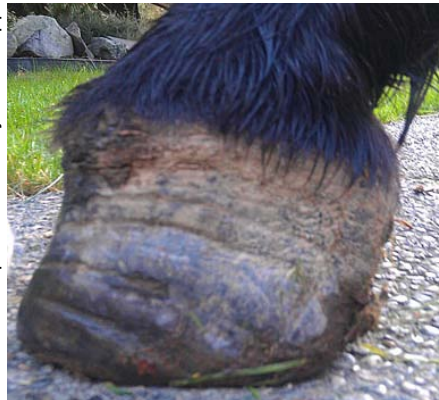
The condition of Destiny's right front hoof at the end of 2011. X-ray below taken in December 2011.