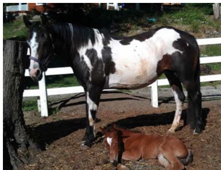
Destiny with her foal laying down beside her in the summer of 2011.

years, and she's also had some foals along the way. We got a hold of an old photo of her, in which the right front looked rather normal. It suggests that the trouble with the right front was man-made. All we know for certain is that she suffered from horse care professional ignorance for some time. She is left side dominant, which means she loads her left front hoof more, making it wider and flatter. Since the right front is loaded less, it tends to grow more upright. This is often referred to as high/low syndrome and is, unfortunately, still too often incorrectly addressed through trimming. It is