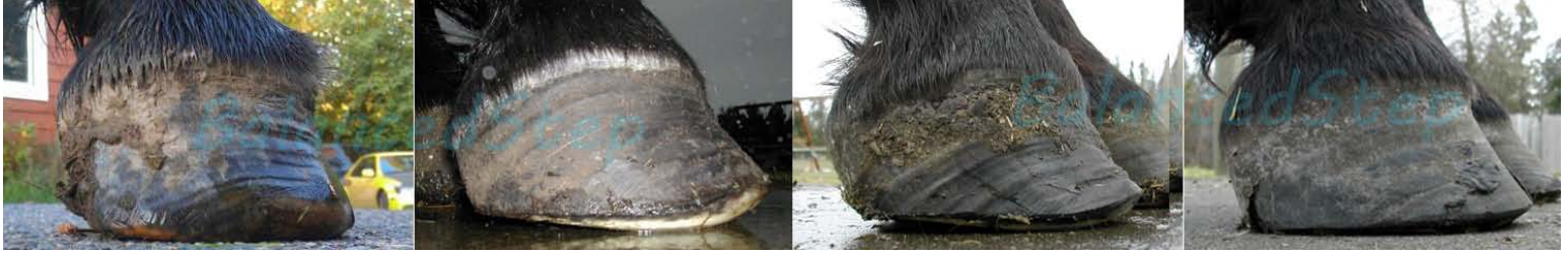
(Left to Right) Hoof photos show what we started with in Dec. 11, then Jan. 12, Feb. 12 and Nov. 12—when she became sound.

One cannot say something is not possible until it has been thoroughly tried, as this story shows so well! Never give up as long as there's hope!