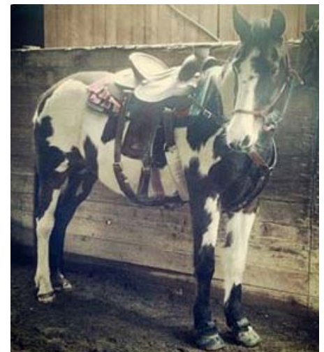
Destiny in January 2014.

After that, we never looked back. She had a few minor set backs due to abscessing, but she